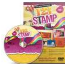
123 Stamp Volume 1 DVD