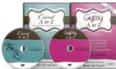
Cricut & Gypsy A to Z DVDs