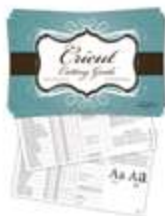
The Cricut Cutting Guide

Master Your Craft with Our Educational DVDs